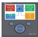
Color Control GX